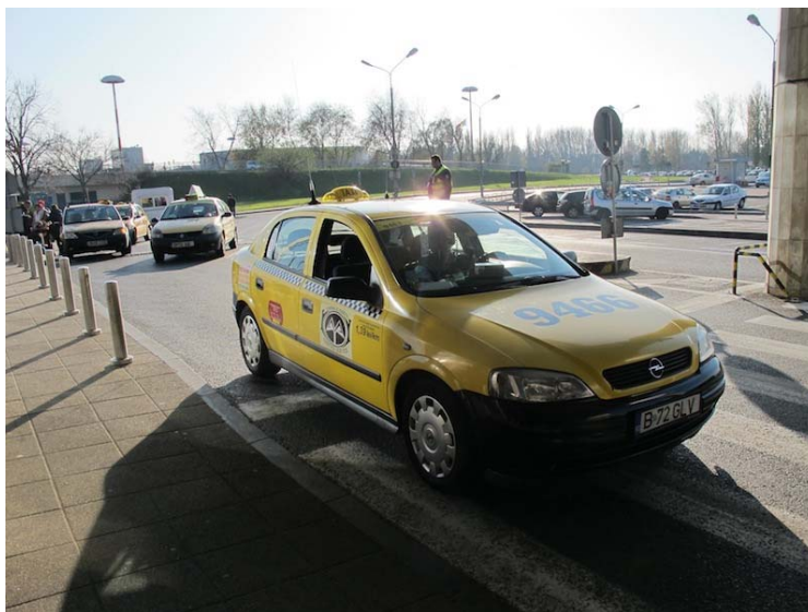
A typical (official) taxi in Bucharest

2. Then go out and look out for the taxi with the number indicated on your ticket (e.g. 577)