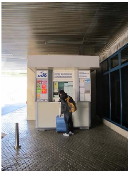
This is the ticket kiosk at the airport (lowest floor, next to the bus stop)

2. Tickets – you can only buy a ticket in the kiosk (RATB) next to the bus station (not in the bus!). Be prepared that the ticket vendor may not speak English or other foreign languages.