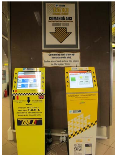
Taxi ticket machines at the Bucharest airport (for instance next to the information desk)

2. Then go out and look out for the taxi with the number indicated on your ticket (e.g. 577)