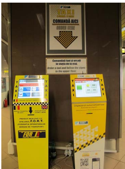
Taxi ticket machines at the Bucharest airport (for instance next to the information desk)

2. Then go out and look out for the taxi with the number indicated on your ticket (e.g. 577)